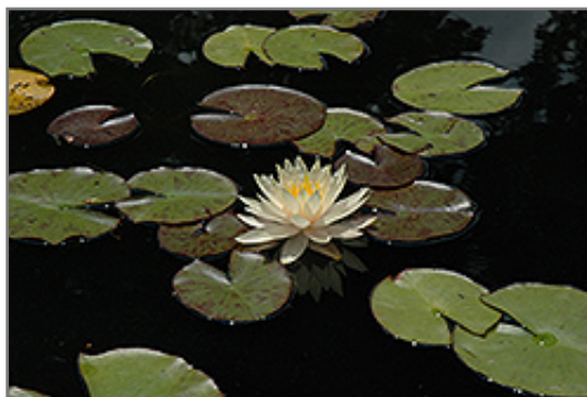
William Falconer Hardy Water Lily flowers