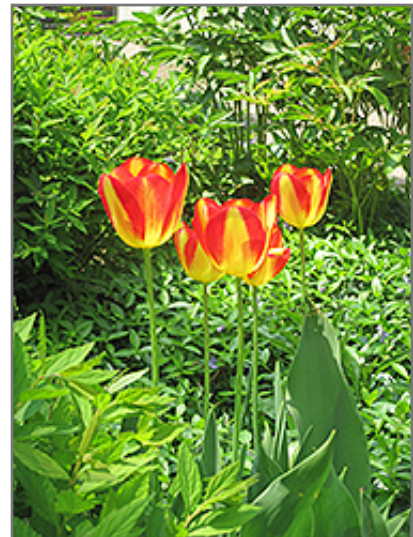
Antoinette Tulip in bloom