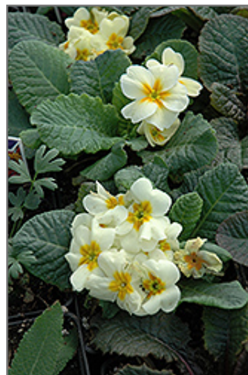
Wanda Primrose flowers

Wanda Primrose is recommended for the following landscape applications;