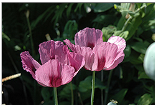
Patty's Plum Poppy flowers