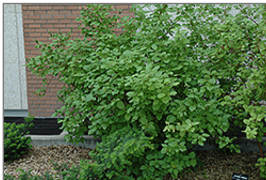
Siberian Dogwood