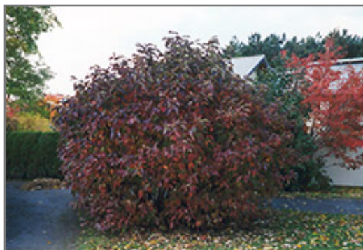
Siberian Dogwood in fall

This shrub performs well in both full sun and full shade. It is an amazingly adaptable plant, tolerating both dry conditions and even some standing water. It is not particular as to soil type or pH. It is highly tolerant of urban pollution and will even thrive in inner city environments. This is a selected variety of a species not originally from North America.