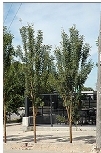
Sutherland Caragana

Sutherland Caragana will grow to be about 17 feet tall at maturity, with a spread of 7 feet. It has a low canopy with a typical clearance of 2 feet from the ground, and is suitable for planting under power lines. It grows at a medium rate, and under ideal conditions can be expected to live for approximately 30 years.