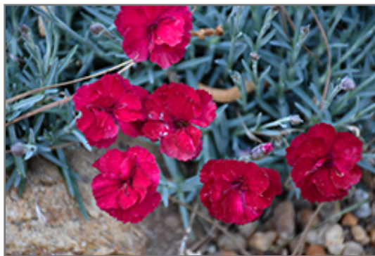
Frosty Fire Pinks flowers