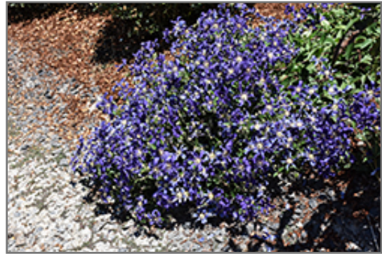
Sapphire Indigo Clematis in bloom