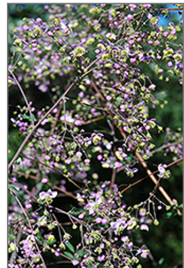
Rochebrun Meadow Rue flowers