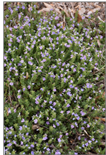
Blue Woolly Speedwell flowers