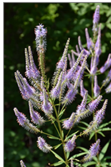
Fascination Culver's Root flowers