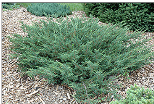
Alpine Carpet Juniper

Alpine Carpet Juniper will grow to be about 8 inches tall at maturity, with a spread of 4 feet. It tends to fill out right to the ground and therefore doesn't necessarily require facer plants in front. It grows at a slow rate, and under ideal conditions can be expected to live for approximately 30 years.