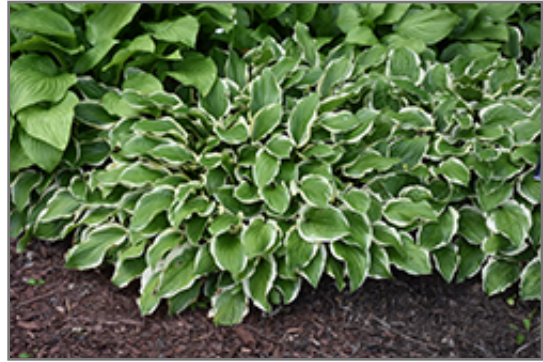
So Sweet Hosta