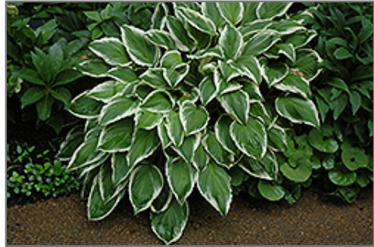
So Sweet Hosta

This plant does best in partial shade to shade. It prefers to grow in average to moist conditions, and shouldn't be allowed to dry out. It is not particular as to soil type or pH. It is somewhat tolerant of urban pollution. This particular variety is an interspecific hybrid. It can be propagated by division; however, as a cultivated variety, be aware that it may be subject to certain restrictions or prohibitions on propagation.