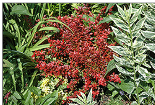
Cherry Bomb Japanese Barberry