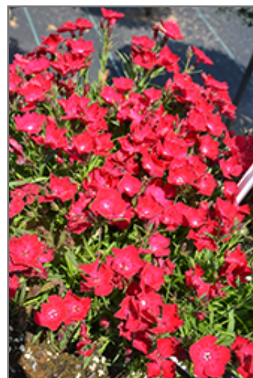
Beauties Tyra Pinks flowers