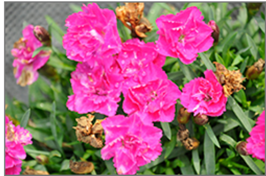
Beauties Melinda Pinks flowers

Beauties Melinda Pinks is recommended for the following landscape applications;