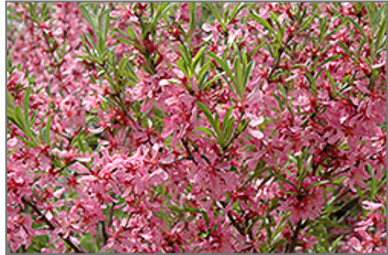
Russian Almond flowers