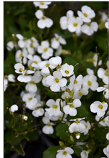
Catwalk White Wall Cress flowers

Catwalk White Wall Cress is recommended for the following landscape applications;