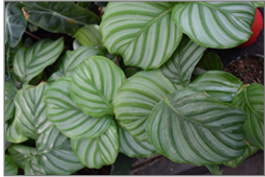
Color Full Orbifolia Prayer Plant foliage

This is an herbaceous evergreen houseplant with an upright spreading habit of growth. Its relatively coarse texture stands it apart from other indoor plants with finer foliage. This plant should not require much pruning, except when necessary to keep it looking its best.