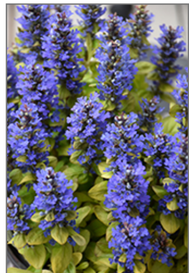
Feathered Friends Petite Parakeet Bugleweed flowers