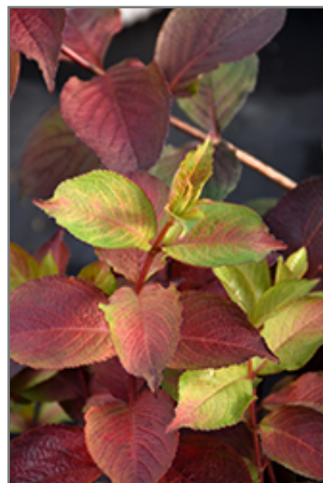
Midnight Sun Reblooming Weigela foliage