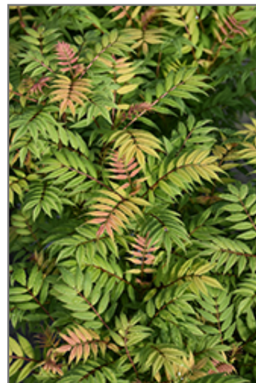
Mr. Mustard False Spirea foliage