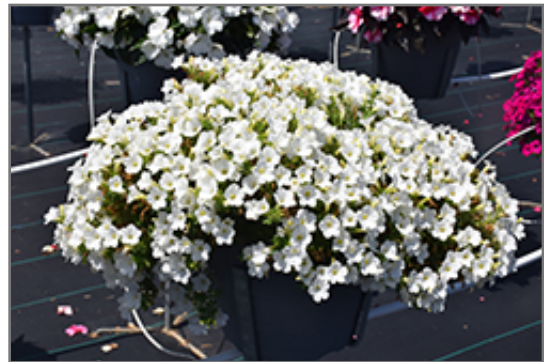
Itsy White Petunia in bloom