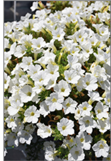
Itsy White Petunia flowers

This plant will require occasional maintenance and upkeep. Trim off the flower heads after they fade and die to encourage more blooms late into the season. It is a good choice for attracting bees, butterflies and hummingbirds to your yard, but is not particularly attractive to deer who tend to leave it alone in favor of tastier treats. It has no significant negative characteristics.