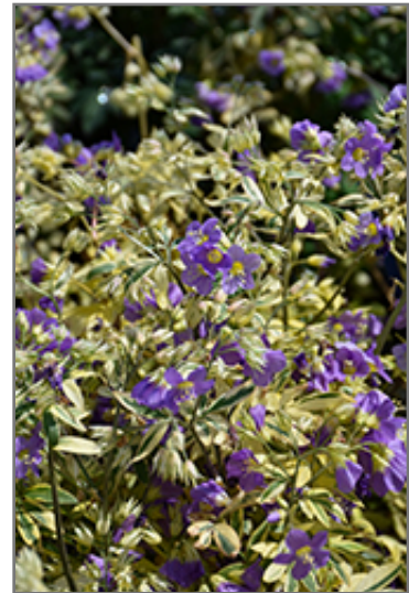
Golden Feathers Jacob's Ladder flowers

Golden Feathers Jacob's Ladder is recommended for the following landscape applications;