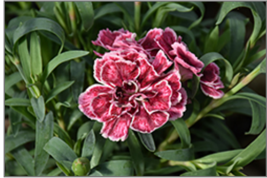
Constant Beauty Crush Burgundy Pinks flowers

This is a relatively low maintenance plant, and is best cleaned up in early spring before it resumes active growth for the season. It is a good choice for attracting bees and butterflies to your yard, but is not particularly attractive to deer who tend to leave it alone in favor of tastier treats. It has no significant negative characteristics.