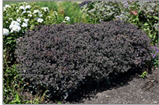
Night Light Stonecrop in bloom

Night Light Stonecrop is recommended for the following landscape applications;