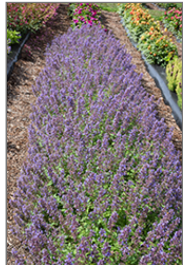
Whispurr Blue Catmint in bloom