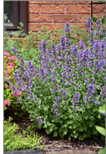
Picture Purrfect Catmint flowers

Picture Purrfect Catmint is a dense herbaceous perennial with a mounded form. Its relatively fine texture sets it apart from other garden plants with less refined foliage.