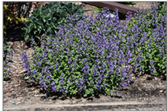
Picture Purrfect Catmint in bloom