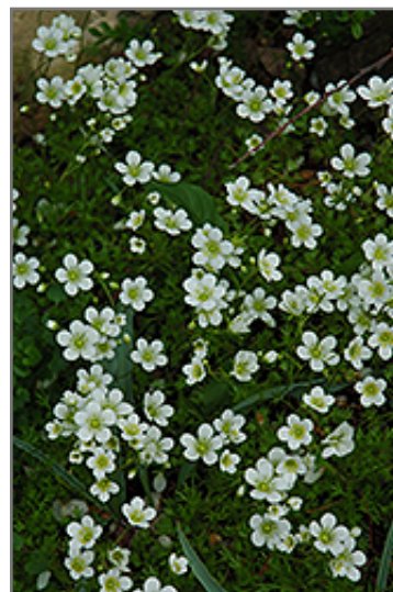
Spring Snow Saxifrage flowers

Spring Snow Saxifrage will grow to be only 6 inches tall at maturity, with a spread of 8 inches. When grown in masses or used as a bedding plant, individual plants should be spaced approximately 6 inches apart. It grows at a medium rate, and under ideal conditions can be expected to live for approximately 5 years. As an herbaceous perennial, this plant will usually die back to the crown each winter, and will regrow from the base each spring. Be careful not to disturb the crown in late winter when it may not be readily seen!