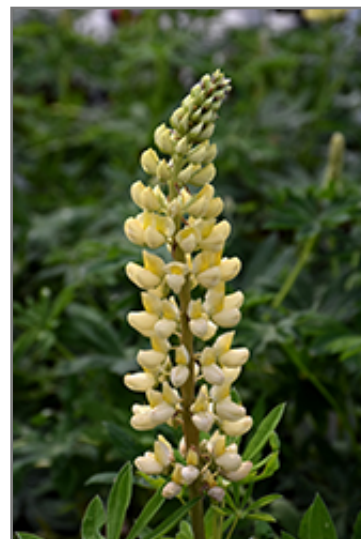
Chandelier Lupine flowers