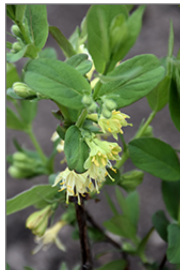
Boreal Blizzard Honeyberry flowers

This shrub is quite ornamental as well as edible, and is as much at home in a landscape or flower garden as it is in a designated edibles garden. It does best in full sun to partial shade. It prefers dry to average moisture levels with very well-drained soil, and will often die in standing water. It is not particular as to soil type or pH. It is highly tolerant of urban pollution and will even thrive in inner city environments. This is a selected variety of a species not originally from North America.