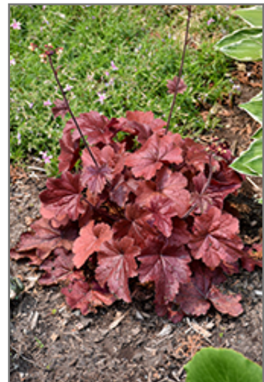
Northern Exposure Red Coral Bells