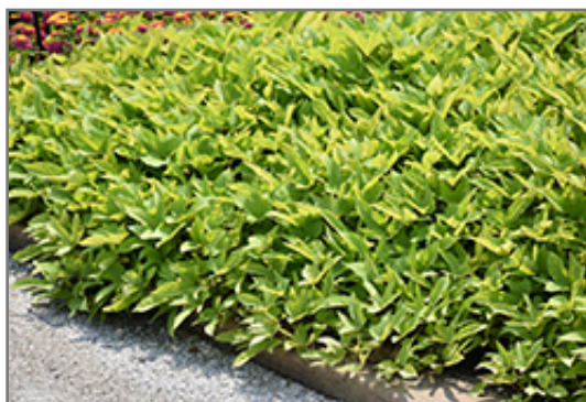
SolarTower Lime Sweet Potato Vine