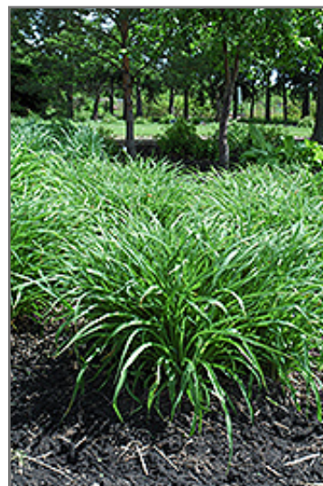
Moor Grass

Moor Grass will grow to be about 12 inches tall at maturity extending to 24 inches tall with the flowers, with a spread of 24 inches. Its foliage tends to remain dense right to the ground, not requiring facer plants in front. It grows at a slow rate, and under ideal conditions can be expected to live for approximately 15 years. As an herbaceous perennial, this plant will usually die back to the crown each winter, and will regrow from the base each spring. Be careful not to disturb the crown in late winter when it may not be readily seen!