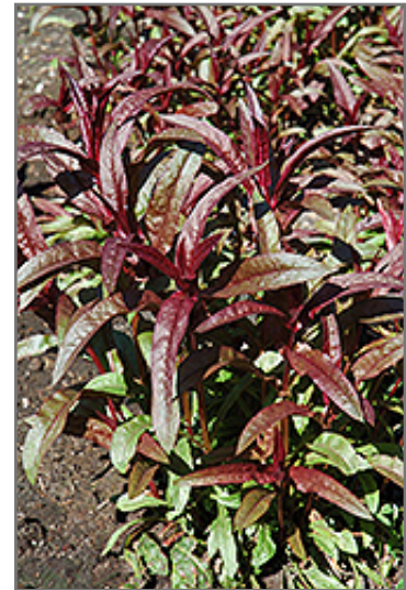
Firecracker Loosestrife foliage

Firecracker Loosestrife is a fine choice for the garden, but it is also a good selection for planting in outdoor pots and containers. With its upright habit of growth, it is best suited for use as a 'thriller' in the 'spiller-thriller-filler' container combination; plant it near the center of the pot, surrounded by smaller plants and those that spill over the edges. It is even sizeable enough that it can be grown alone in a suitable container. Note that when growing plants in outdoor containers and baskets, they may require more frequent waterings than they would in the yard or garden. Be aware that in our climate, most plants cannot be expected to survive the winter if left in containers outdoors, and this plant is no exception. Contact our experts for more information on how to protect it over the winter months.