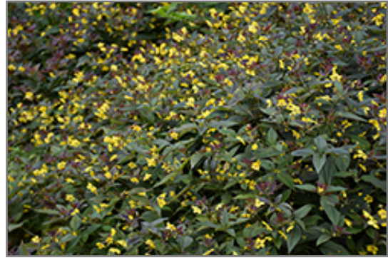
Firecracker Loosestrife in bloom

Firecracker Loosestrife is recommended for the following landscape applications;