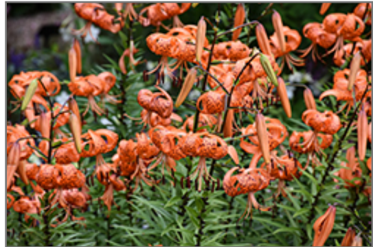
Tiger Lily flowers