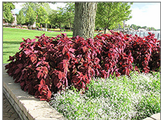
ColorBlaze Rediculous Coleus