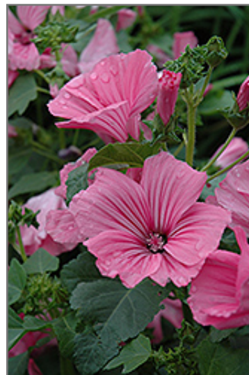
Novella Rose Lavatera flowers