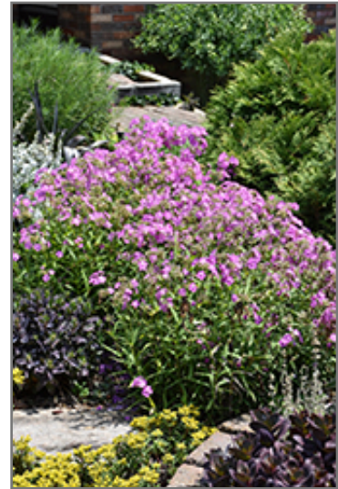
Opening Act Ultrapink Phlox in bloom