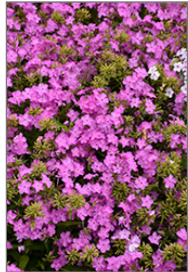
Opening Act Ultrapink Phlox flowers

Opening Act Ultrapink Phlox will grow to be about 22 inches tall at maturity, with a spread of 3 feet. When grown in masses or used as a bedding plant, individual plants should be spaced approximately 32 inches apart. Its foliage tends to remain dense right to the ground, not requiring facer plants in front. It grows at a fast rate, and under ideal conditions can be expected to live for approximately 1 years. As an herbaceous perennial, this plant will usually die back to the crown each winter, and will regrow from the base each spring. Be careful not to disturb the crown in late winter when it may not be readily seen!