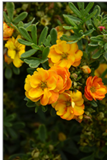
Marmalade Potentilla flowers

Marmalade Potentilla is recommended for the following landscape applications;