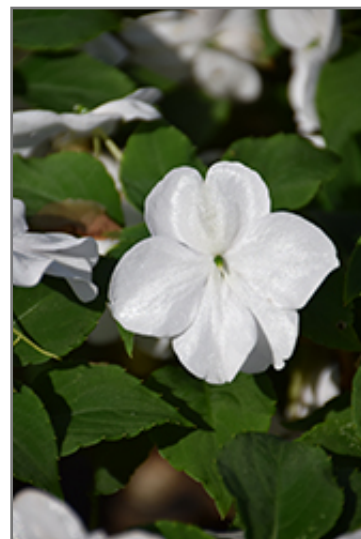
Beacon White Impatiens flowers

Beacon White Impatiens is recommended for the following landscape applications;