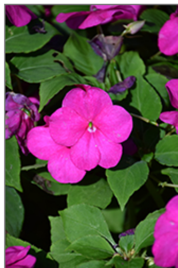
Beacon Violet Shades Impatiens flowers