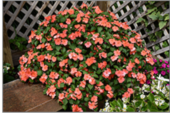
Beacon Salmon Impatiens in bloom

Beacon Salmon Impatiens is recommended for the following landscape applications;