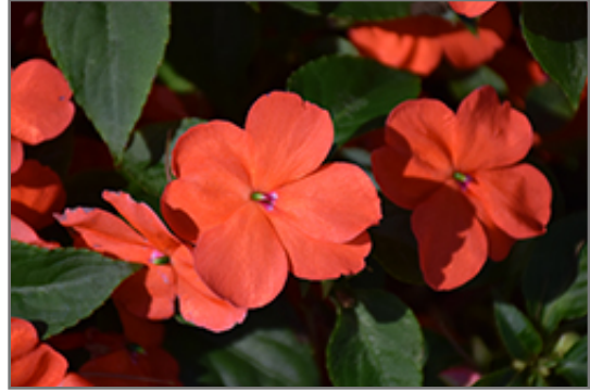
Beacon Salmon Impatiens flowers

Beacon Salmon Impatiens will grow to be about 15 inches tall at maturity, with a spread of 12 inches. When grown in masses or used as a bedding plant, individual plants should be spaced approximately 8 inches apart. Its foliage tends to remain dense right to the ground, not requiring facer plants in front. This fast-growing annual will normally live for one full growing season, needing replacement the following year.