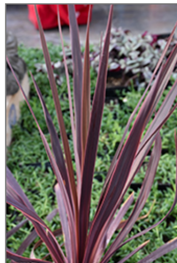
Black Knight Grass Palm foliage