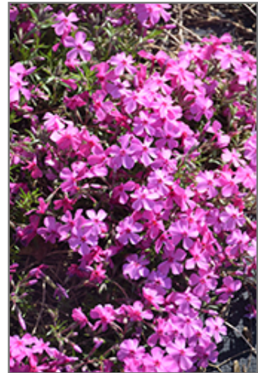
Spring Dark Pink Moss Phlox flowers

Spring Dark Pink Moss Phlox is recommended for the following landscape applications;