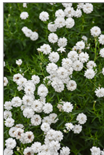
Peter Cottontail Yarrow flowers