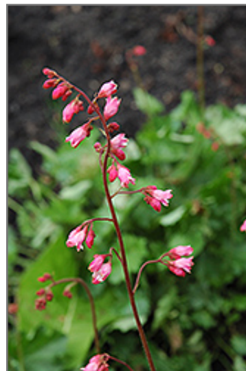
Brandon Pink Coral Bells flowers