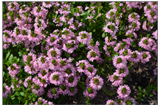
Whirlwind Pink Fan Flower flowers