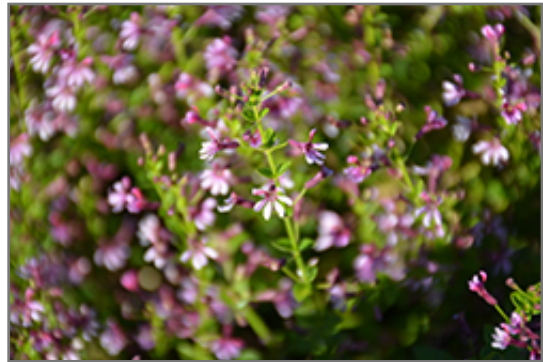
Fairy Dust Pink Cuphea flowers

Fairy Dust Pink Cuphea is recommended for the following landscape applications;