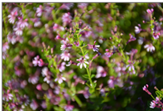
Fairy Dust Pink Cuphea flowers

Fairy Dust Pink Cuphea is recommended for the following landscape applications;