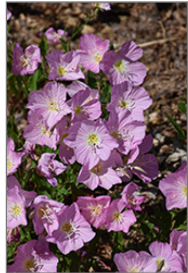
Twilight Evening Primrose flowers